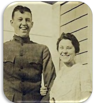
Bill Wilson and his wife, Lois on their wedding day.