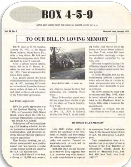
BOX 459, AA's quarterly newspaper, gives memoriam to Bill's memory.

"Pass It On" Bill's Story of how A.A. reached the world.