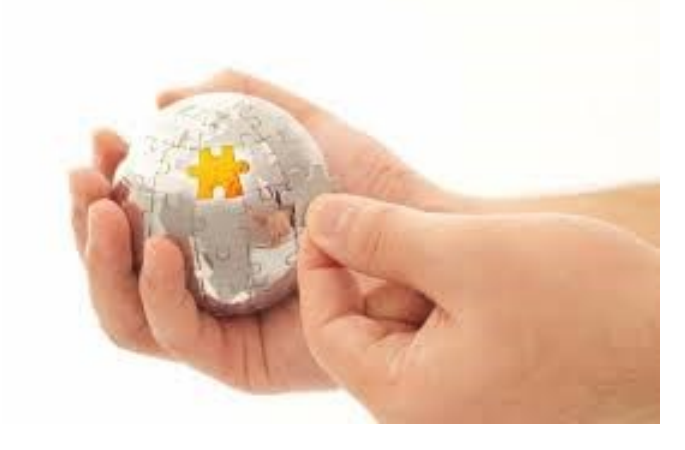
"Rarely have we seen a person fail who has thoroughly followed our path."

ALL TOGETHER, MANCHESTER TRI-STEP BEGINNERS, LACONIA SAT MORNING STEP MTG, BRADFORD NOONTIME GROUP, MANCHESTER HIGH NOONERS, PORTSMOUTH SISTERS IN SOBRIETY, KEENE MEN'S BEGINNERS GROUP, DERRY KITCHEN TABLE GROUP, NO HAMPTON HAPPY HOUR BB MTG, NEWPORT DISCUSSION MEETING, NEWPORT EXETER BEGINNERS, EXETER MID-WEEK TUNE UP, NASHUA ONE DAY AT A TIME, HOPKINTON WOMEN'S GROUP, KEENE WOMEN'S POSITIVE STEPS, HAMPTON 12 STEP GROUP, LITTLETON FIRST LIGHT OF DAY, MANCHESTER